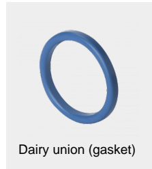
Dairy union (gasket)