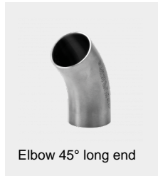
Elbow 45° long end