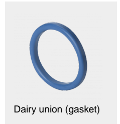
Dairy union (gasket)