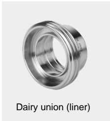
Dairy union (liner)