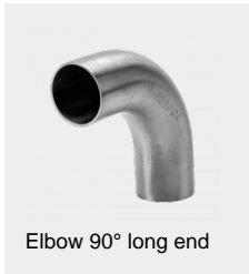
Elbow 90° long end