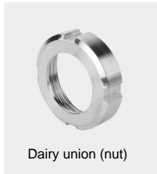
Dairy union (nut)