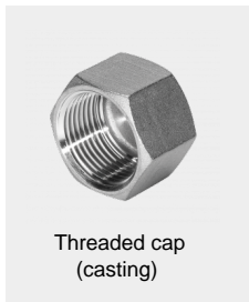
Threaded cap (casting)