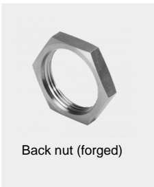
Back nut (forged)