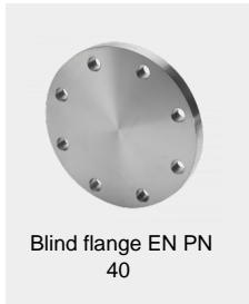
Blind flange EN PN 40