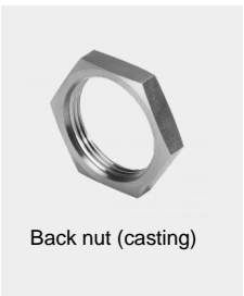
Back nut (casting)