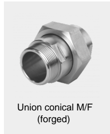
Union conical M/F (forged)